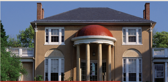
Tudor Place at 1644 31st Street, one of the finest neo-classical houses in the United States.