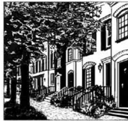
CITIZENS ASSOCIATION of GEORGETOWN